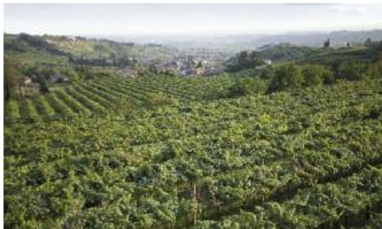
THE WINEGROWING REGION OF VALPOLICELLA SPREADS OVER AN AREA OF 30,000 HECTARES

glycerine in the must. This process results in a period of pre-maceration inside the grapes, which undergo a micro-enzymatic transformation that promotes the development of the wine's secondary aromas. The wet climatic conditions that can occur in October can prove problematic given that the grapes should ideally be pressed in the January following the harvest. For example, although 1982 was an excellent year for Bordeaux wines, it was difficult for Amarones as the month of October was very wet and the grapes were exposed to mildew during appassimento . As a result, some estates invested in modern drying trays and installed systems for reducing dampness to guarantee better quality grapes, as well as systems that allow the reduction of the level of sulphur dioxide and the option of either endogenous or exogenous fermentation as appropriate to prioritise the use of native yeast. Masi is the sole winery with a fully automated ventilation system. For its part, the Tenuta Sant'Antonio winery opts for slow fermentation at low temperatures (around 21-22 °C), conserving the fruit and the freshness of the wine, unlike classic Amarones, which are almost too oxidised and round, such as those traditionally made at the Bertani estate. The 2007 Campo dei Gigli and the 2007 Amarone Riserva represent the best expressions of Tenuta Sant'Antonio Amarone.