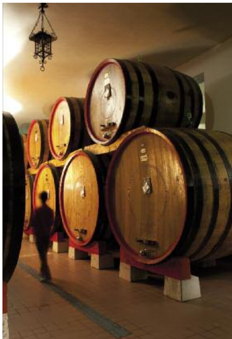
BOLLA WAS FORMERLY OWNED BY THE AMERICAN DISTRIBUTOR BROWN-FORMAN